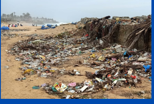
Dumping of Waste on Beaches

Based on fieldwork undertaken between December 26, 2019, and the present, The projects listed below can be implemented in all of the coastal areas of the Kanyakumari district.