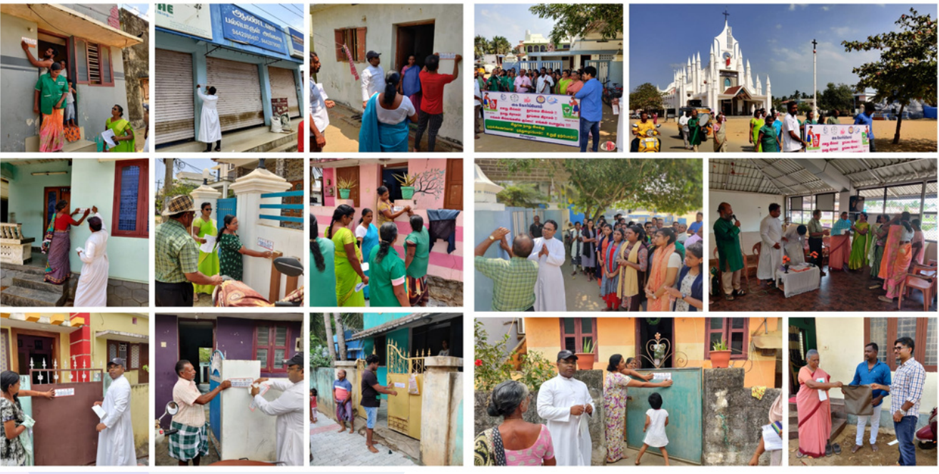
Unit-wise Plastic Waste Collection Project in Chinnathurai, Kanyakumari District