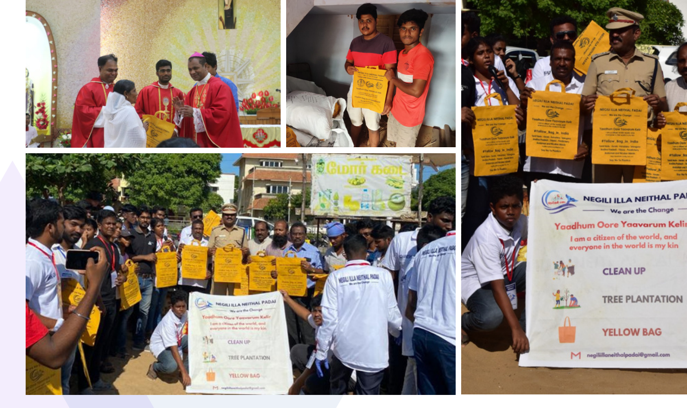
Fig. 9. Yaadhum Oore Yaavarum Kelir: Yellow Bag Project

Inspired by our beloved Chief Minister of Tamil Nadu Thiru. M.K. Stalin's "Meendum Manjaippai Thittam," our team came up with the idea that yellow bags be provided in every home as an alternative to plastic or single-use shopping bags. On February 5, 2022, we launched the Yellow Bag campaign together with Negili Illa Neithal Padai, Clean & Green Chinnathurai, and HEAL Movement. As of March 2023 , each household will be given two cloth bags instead of plastic bags to utilize daily.