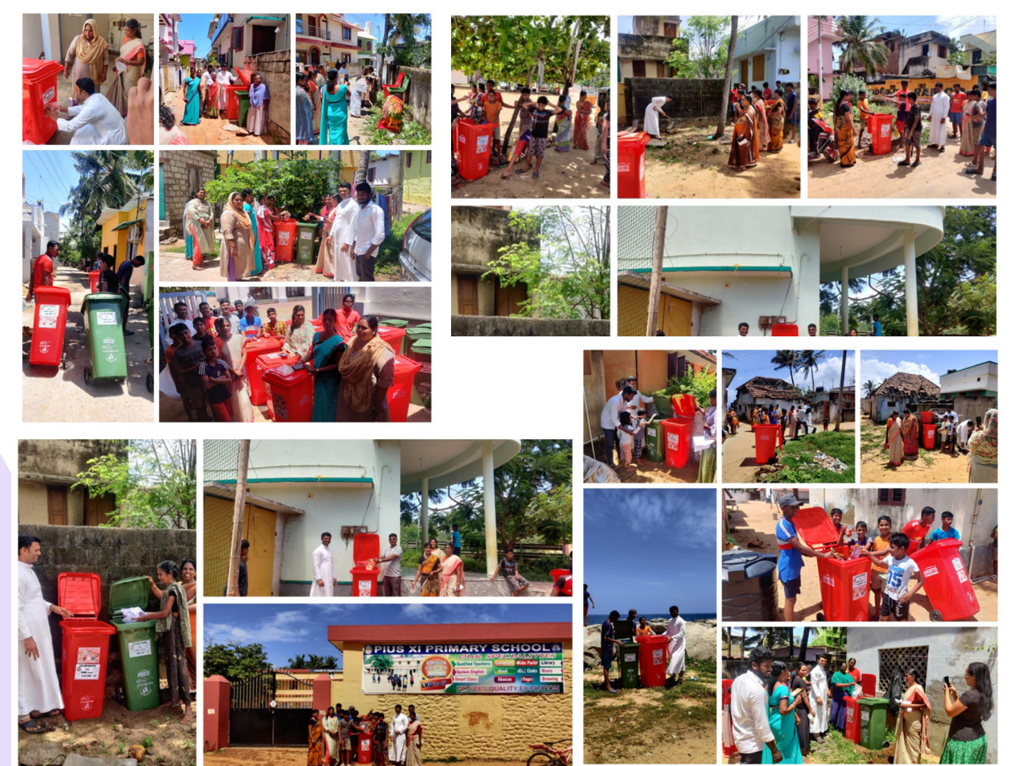
Unit-wise Plastic Waste Collection Project in Chinnathurai, Kanyakumari District

We launched the Unit Wise Plastic Waste Collection initiative on May 22, 2022, in collaboration with Negili Illa Neithal Padai, Clean & Green Chinnathurai. We requested our village residents to separate the used plastics. They will segregate the plastic waste and drop it off at the collection drum once a week, and then the collecting team will continue the recycling process. As of March 2023 , we collected over 300 kilograms of plastic waste from Chinnathurai householders.